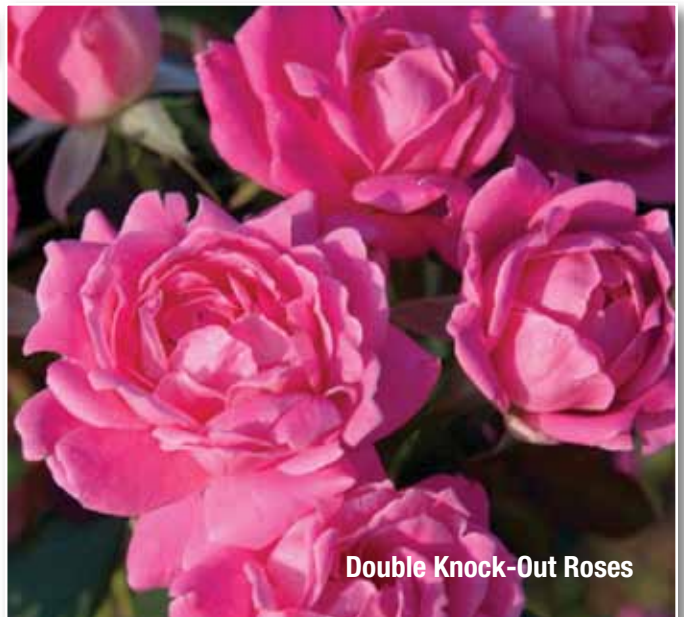
Double Knock-Out Roses

A copy of our Rose Brochure may be downloaded on our website, www.garrisonsnursery.com .