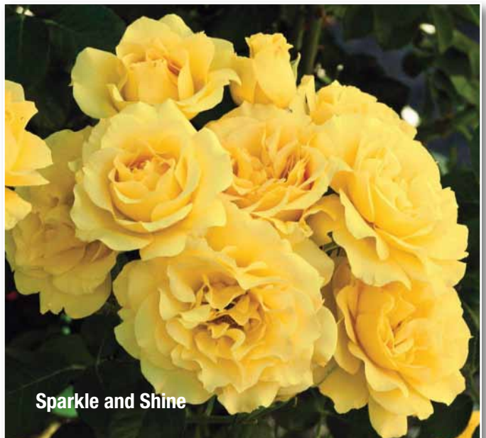
Sparkle and Shine