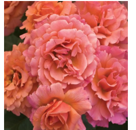
Easy Does It

Double Delight-red/white Easy Does It-orange/pink Ebb Tide - lavender Iceberg - white Julia Child - yellow Jump for Joy - pink Rio Samba-orange/yellow Scentimental - red/white Sunsprite - yellow