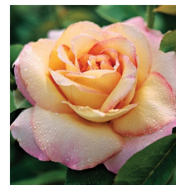
Peace Featured on U.S. Stamp

Yellow Elina Gold Medal Mellow Yellow Midas Touch Oregold Peace St Patrick