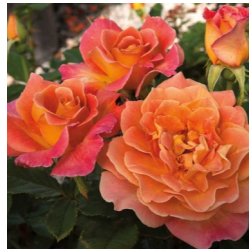
Rosey the Riveter

Orange Chihuly Easy Does It Livin' Easy Playboy Rosey the Riveter